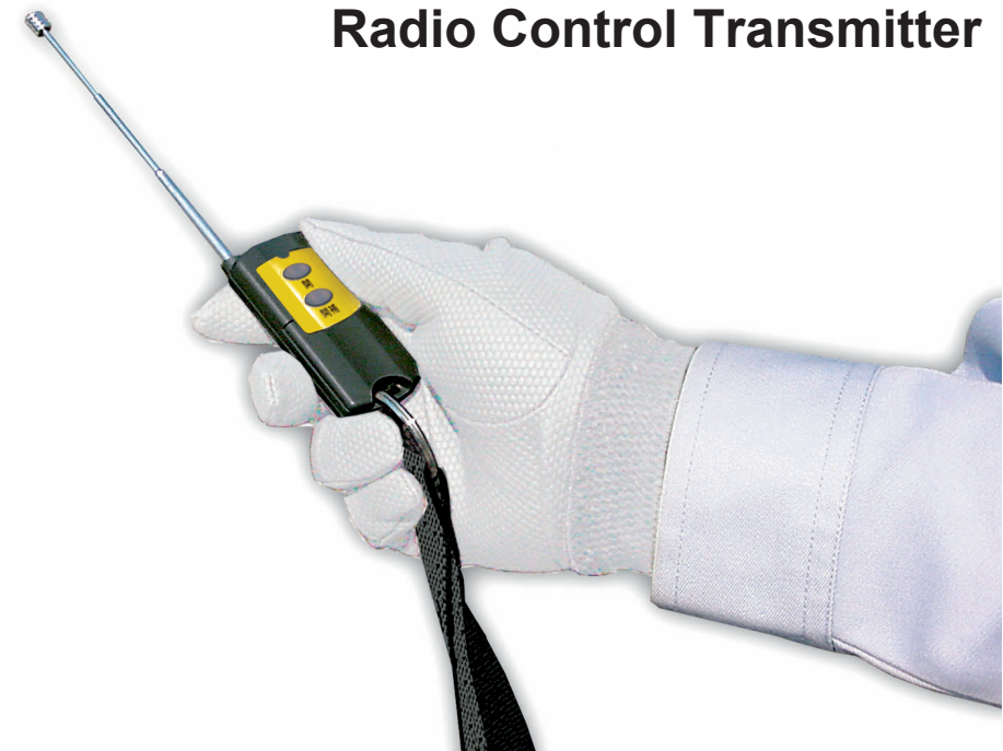
Radio Control Transmitter